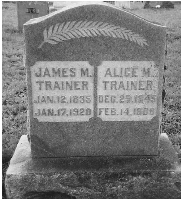
11. The Trainer headstone in Mt. Olive Cemetery, Bexar County, Texas.