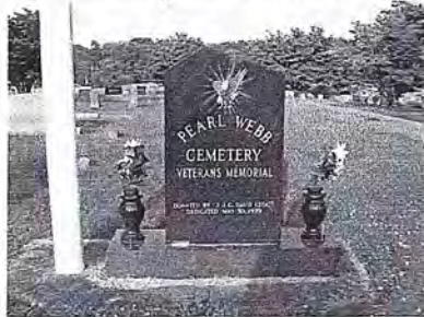
Photo of Pearl Webb Cemetery Veterans Memorial

The yearly meeting for the Pearl Webb Cemetery is the second Tuesday in March at 7 o'clock p.m. at the Hardyville Union Church. Mark this date on your calendar. I feel it is very important for each of us to remain interested in the upkeep of the grounds, the financial success; as well as, the overall appearance of the place of rest for our loved ones, which is an admirable and respectful part of our community in Hart County.